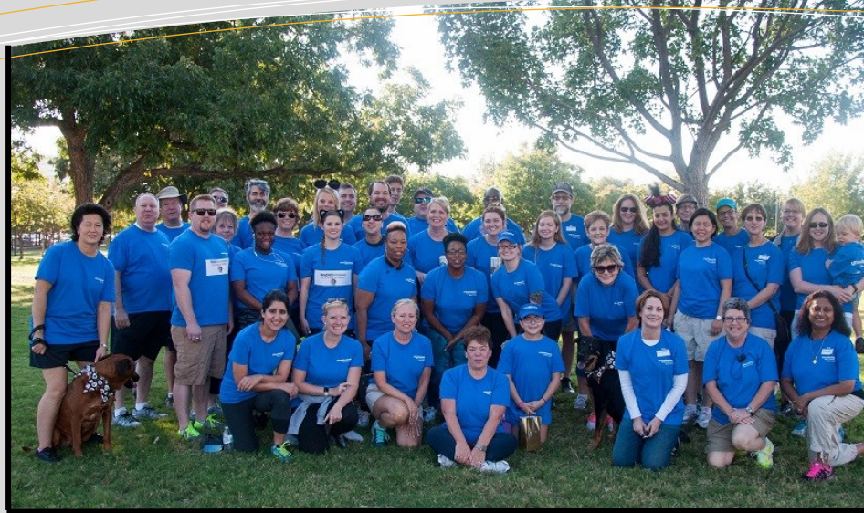
2016 DFW WALK for Brain Injury: UT Southwestern Out in Full Force