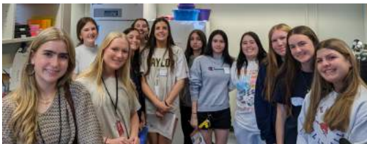
Students touring the Varadarajan lab. They performed optical illusions and extracted DNA using household items.

Huge thanks to the 30+ volunteers who made STARS Neuroscience Day a resounding success!