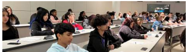
Students learn about the wonders of the nervous system!

Special thanks to the Neuroscience Dept. and OBI for their support!